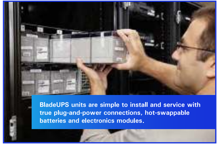
BladeUPS units are simple to install and service with true plug-and-power connections, hot-swappable batteries and electronics modules.

Equally beneficial is the company’s ability to employ a pay-as-it-grows approach. “As we put them in, it enables us to not have to expand large sums of cash upfront,” Haines points out. “When you buy a 400 kVA unit, it requires a large sum of money upfront, even though you may be only using a small portion of the available kVA. The BladeUPS just made more sense.”