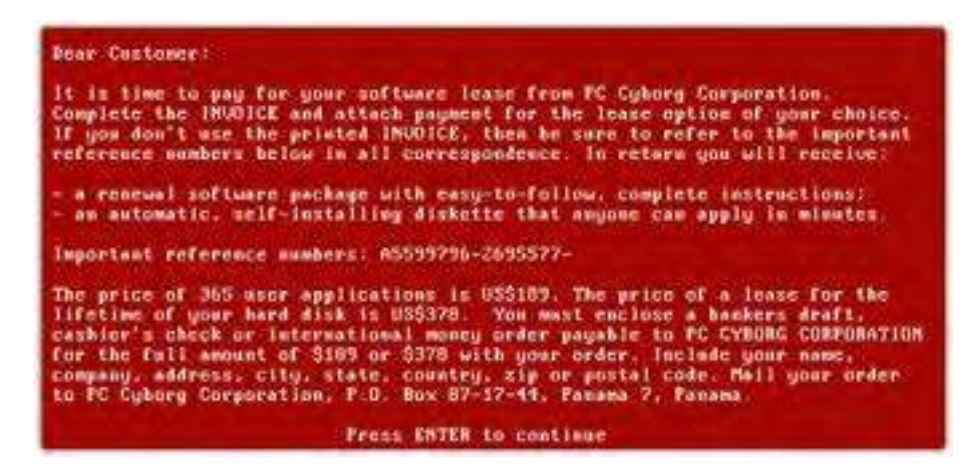
Figure 1- An example of the Aids Trojan demand

Fast-forward to 2013, when a huge spike in ransomware attacks fuelled by the release of the notorious CryptoLocker malware. CryptoLocke was a highly sophisticated new malware using asymmetric encryption (only the attacker has the private unlock key). The success of CryptoLocker spawned a vast number of cloned ransomware programs, all using asymmetric encryption to deny a user access to their files.