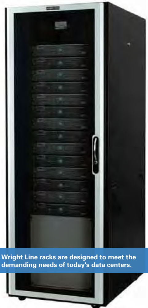
Wright Line racks are designed to meet the demanding needs of today's data centers.