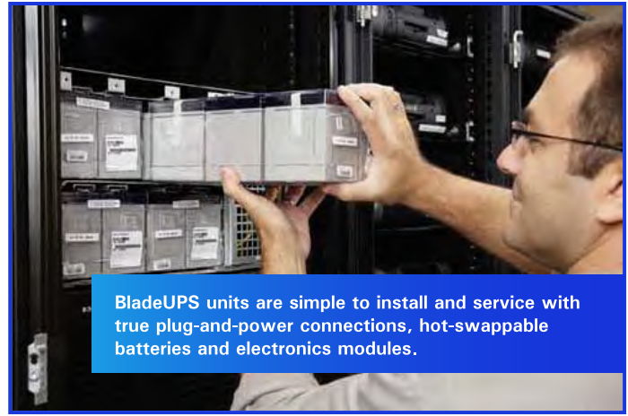
BladeUPS units are simple to install and service with true plug-and-power connections, hot-swappable batteries and electronics modules.

Equally beneficial is the company’s ability to employ a pay-as-it-grows approach. “As we put them in, it enables us to not have to expand large sums of cash upfront,” Haines points out. “When you buy a 400 kVA unit, it requires a large sum of money upfront, even though you may be only using a small portion of the available kVA. The BladeUPS just made more sense.”